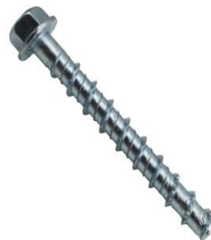
Concrete Screw 10*75