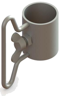
TG Barrier Clip